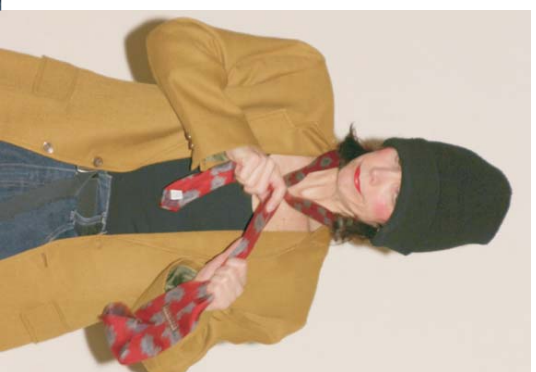
Drunk Male harasses audience . . .